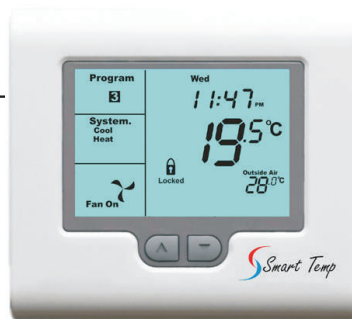
Smart Temp SMT-770 Chameleon