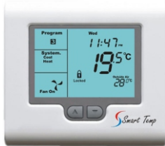
Smart Temp SMT-770 Chameleon