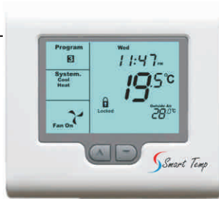
Smart Temp SMT-770 Chameleon