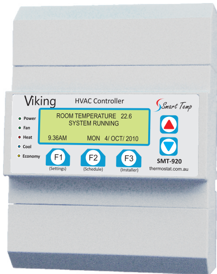
Smart Temp Model SMT-920 Viking Programmable Thermostat