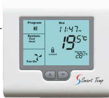
Smart Temp SMT-770 Chameleon