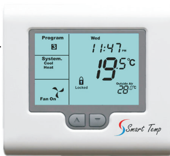
Smart Temp SMT-770 Chameleon