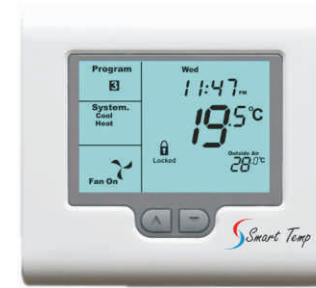
Smart Temp SMT-770 Chameleon