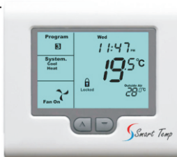
Smart Temp SMT-770 Chameleon

All care has been taken in the preparation of this drawing however Smart Temp Australia accept no responsibility for damage that may be caused by using this information. This is a guide only.